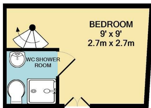
FIRST FLOOR APPROX. FLOOR AREA 127.8 SQ.FT. (11.9 SQ.M.)